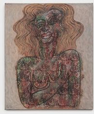
ALEXANDER KALETSKI Lacy Lady , 2017 oil on linen 48 x 40 in (121.9 x 101.6 cm) AZ#2269