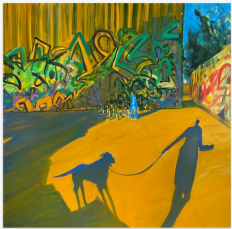
DEBORAH BROWN Candles , 2021 oil on canvas 48 x 48 in (121.9 x 121.9 cm) AZ#2051