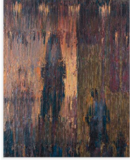
BRADLEY HART Circus (Impression) , 2020 acrylic on wood 58 x 47 in (147.3 x 119.4 cm) AZ#1916

532 W 24 ST NYC NY 10011 TEL 212 243 2100