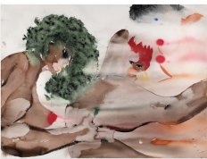
NADINE FARAJ Inside The Veins Of A Petal On A Blooming Redbud Tree II , 2018 watercolor on paper 22 x 30 in (55.9 x 76.2 cm) AZ#1392 Framed