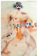
NADINE FARAJ Your Presence Draws Me Out From Vanity , 2017 watercolor on paper 38 x 25.5 in (96.5 x 64.8 cm) AZ#1384 Framed