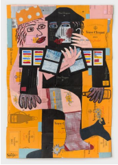
ALEXANDER KALETSKI Rich and Famous , 2019 mixed media on cardboard 62 x 43 in (157.5 x 109.2 cm) AZ#2042