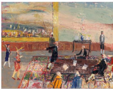
JOHN BRADFORD Washington and His Cabinet , 2019 acrylic, oil on canvas 60 x 78 in (152.4 x 198.1 cm) AZ#1423