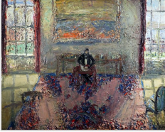
JOHN BRADFORD Lincoln Composing the Emancipation Proclamation , 2021 acrylic, modeling paste, and oil on canvas 48 x 60 in (121.9 x 152.4 cm) AZ#2270