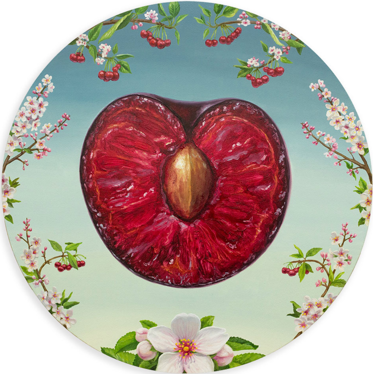
ALONSA GUEVARA Call of the Cherry , 2021 oil on canvas 20 x 20 in (50.8 x 50.8 cm) AZ#2381

532 W 24 ST NYC NY 10011 TEL 212 243 2100