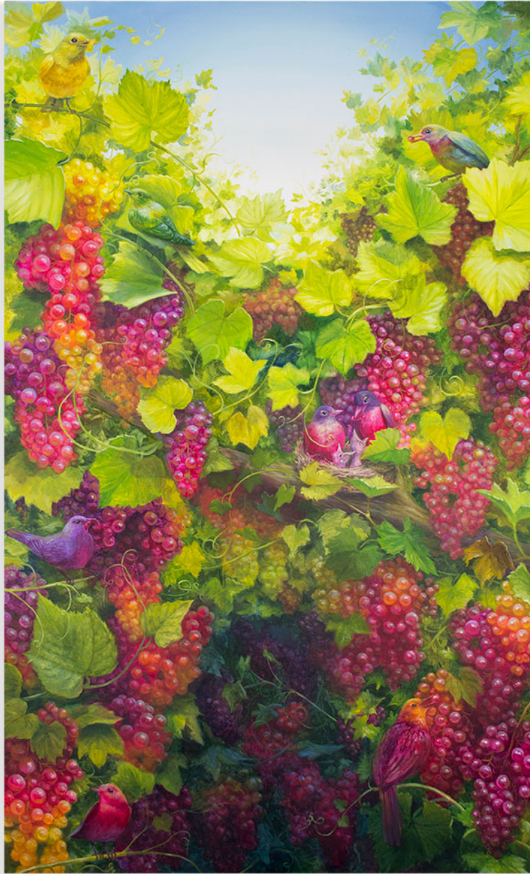
ALONSA GUEVARA Grape Birds , 2022 oil on canvas 50 x 30 in (127 x 76.2 cm) AZ#2316